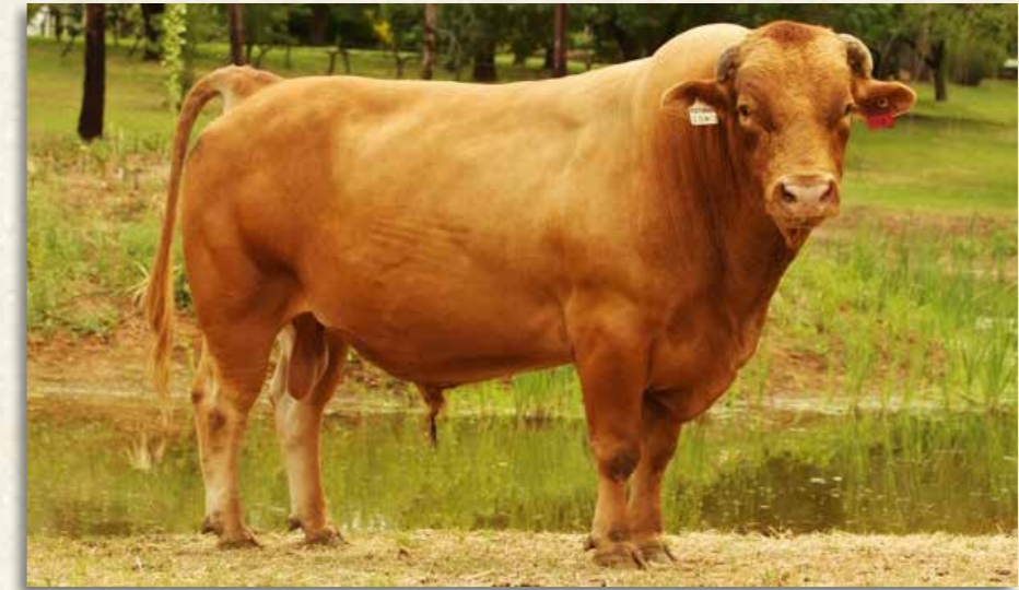
Kalanga Red Star

Semen Available from these Two Outstanding Bulls