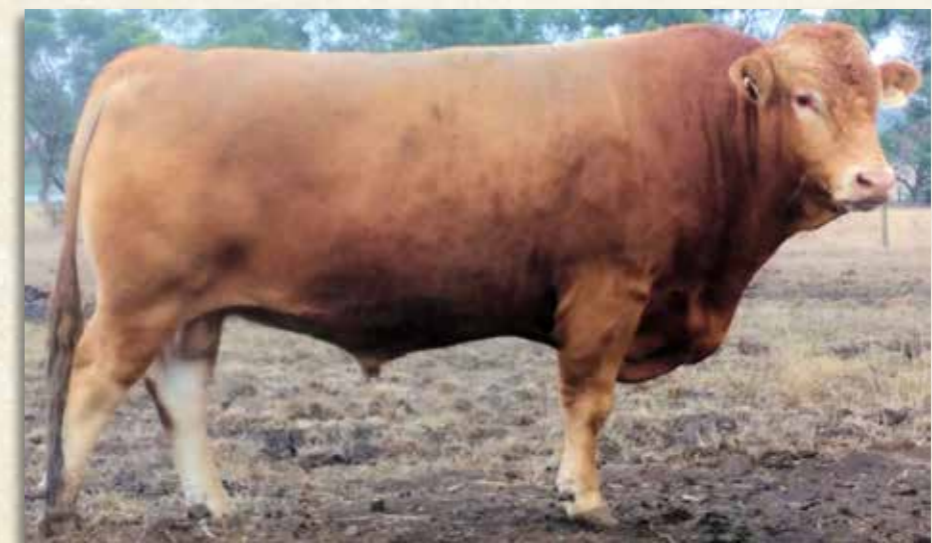
Bald Ridge Henshin